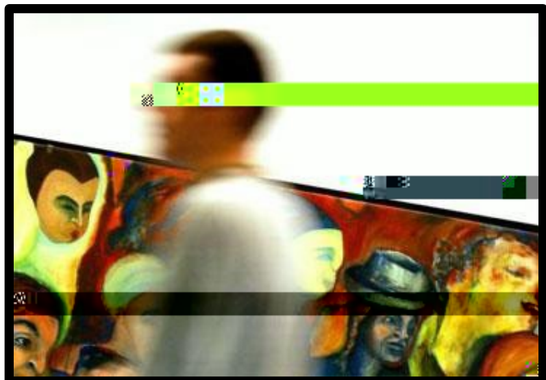
THE FACES OF DNA: A student walks past a piece of artwork on display for the "DNA: Cracking the Ancestor Code" exhibit at Cal State East Bay's C.E Smith Museum of Anthropology.

Her story is just one of many told in the exhibit. Some Latin-American testers found roots in Russia and Scandinavia, others learned they were descendants of Otzi, the Stone Age mummy found preserved in an Italian glacier in 1991.